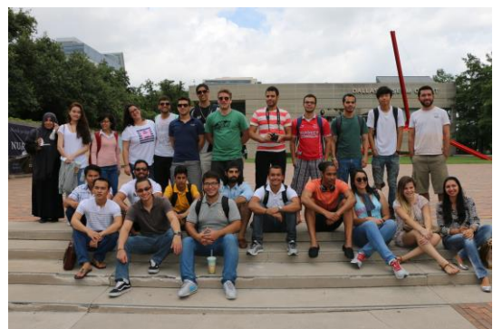
(Dallas Students at Dallas Museum of Art)

At our Dallas campus, students went bowling, visited the Dallas Cowboy football stadium, the Dallas museum of Art, Klyde Warren Park, and created a soccer team and played indoor soccer.