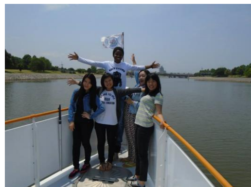
(Some OKC students on a River Cruise)

This fall students will be able to enjoy a cookout at Lake Hefner, a visit to the Cowboy Heritage museum, a visit to the downtown area, and a trip to the movie theater.