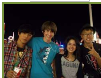
Perris County Fair